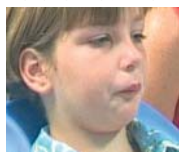
Function always = Form